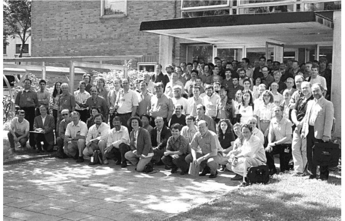
IVOA Interoperability Meeting April 2002