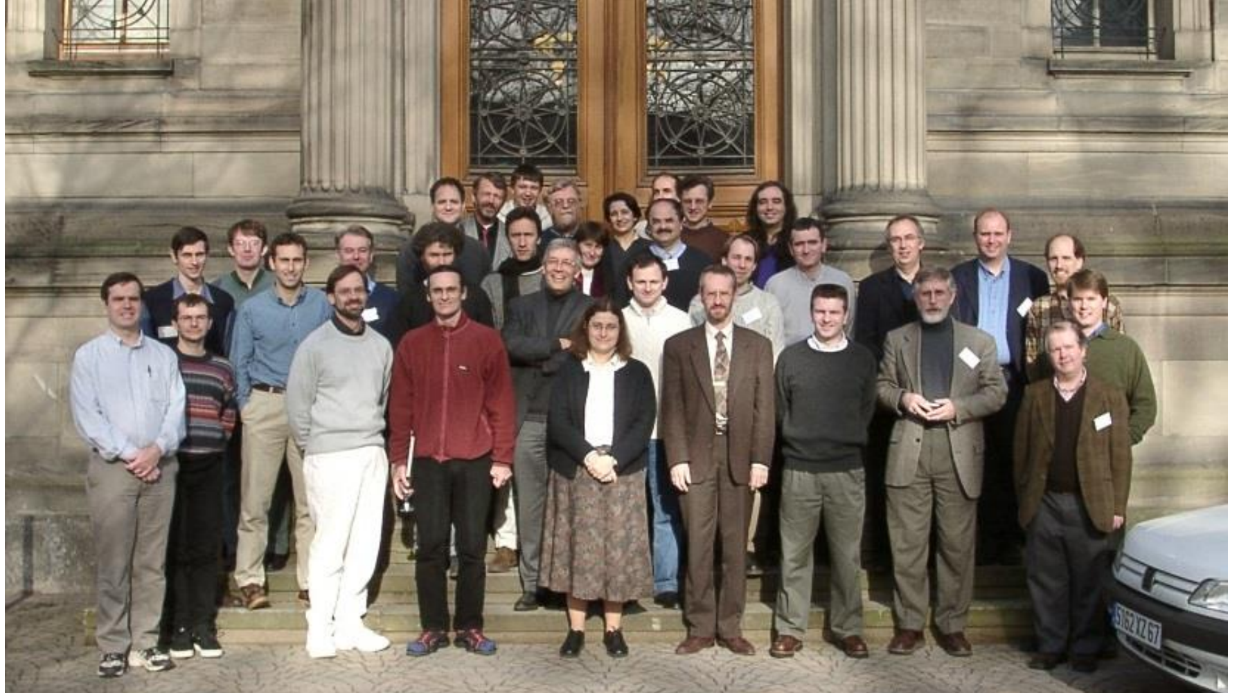
1st Interoperability WG meeting : Strasbourg, France, 28-29 Jan 2002