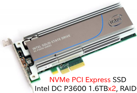
NVMe PCI Express SSD Intel DC P3600 1.6TBx2, RAID0 ALMAWebQL v2 FITS cache