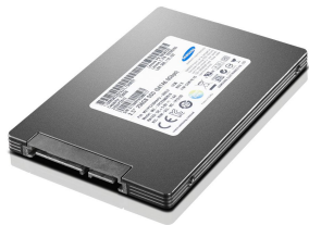
2.5" SATA3 SSD 1TBx8, RAID5 main FITS storage