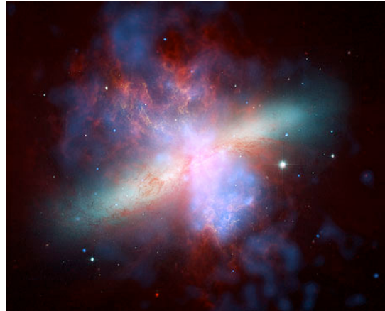
This image of M82 combining x-ray, visible, and infrared light from three observatories is typical example of the kind of visual resources with rich contextual information ideal for AVM tagging.

The astronomical education and public outreach (EPO) community plays a vital role in conveying the results of scientific research to the general public. A key product of EPO development is a variety of non-scientific public image resources; both derived from scientific observations and created as artistic visualizations of scientific results. This refers to general image formats such as JPEG, TIFF, PNG, GIF, not scientific FITS datasets. Such resources are currently scattered across the internet in a variety of galleries and archives, but are not searchable in any coherent or unified way.