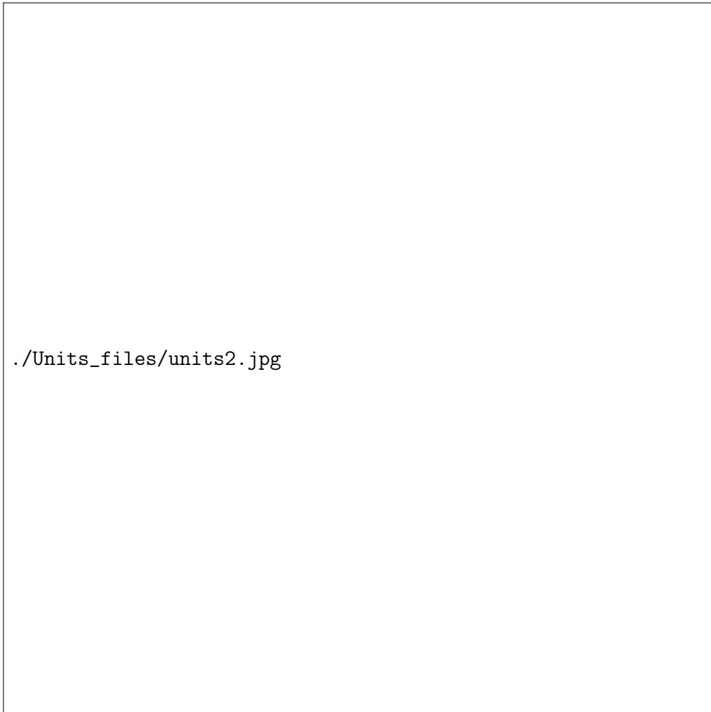
Figure 1: This shows the levels at which conversions might be done. Thick red arrows : At the point where an astronomer or data provider submits input to the VO, we should provide tools to ensure that units are labeled consistently according to the labelling convention adopted. This implies that a units parsing step is included prior to metadata ingestion into the VO. Dashed brown arrows : Conversions required to supply results to the user in specified or reasonable units e.g. J.s^{-1} to W , are done where and when they are required.